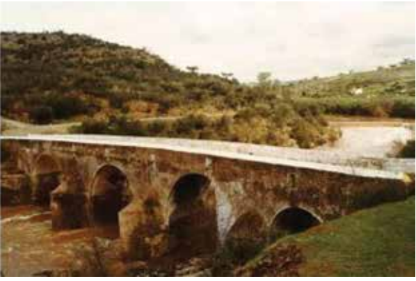
Figure 2. The Ardila River in the Guadiana Basin, southern Portugal, in which the hydrological regime is highly seasonal and expected to become even more strongly affected by extreme floods and droughts. The two photographs were taken less than 1 day apart.