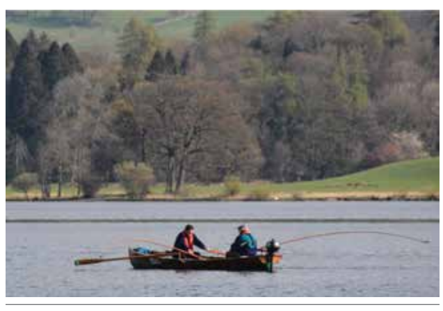
Figure 3. Recreational anglers fishing traditionally for the threatened coldwater Arctic Charr Salvelinus alpinus on Windermere, UK.

Even more than Europe, Latin America contains great variability in climates and hydrological regimes, including alpine, desert, savannah, and tropical rainforest. Tropical parts of South America are likely to experience climate change effects similar to those already described above for tropical Africa, whereas alpine regions are expected to follow patterns similar to Europe. Reductions in annual precipitation are predicted for semi-arid regions, as well as in humid basins such as the Amazon Basin (Saatchi et al. 2012; Oberdorff et al. 2015). Semi-arid and humid regions are predicted to experience increased incidence of extreme precipitation periods (droughts, floods), meaning less predictable water bodies and artisanal fisheries